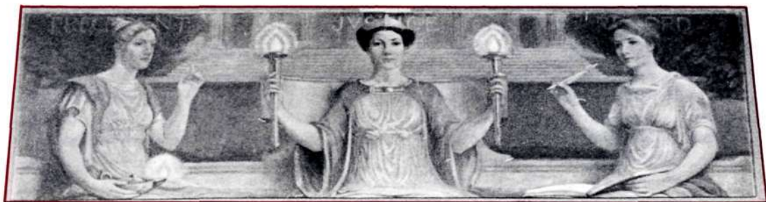
Precedent, Justice, and Record