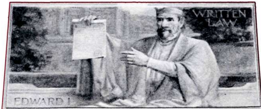
Written Law — Edward I