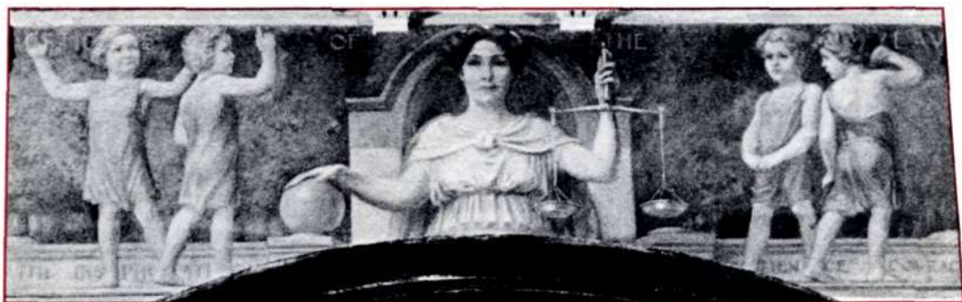
Justice of the Law — Faith and Inspiration, Patience and Courage