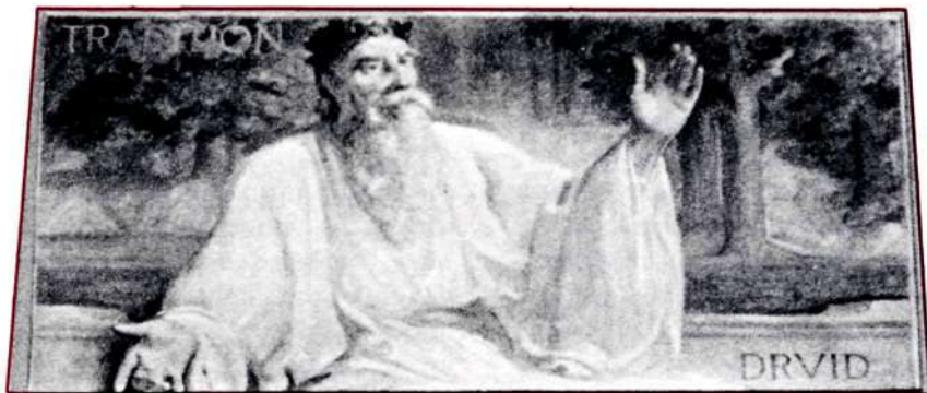
Tradition — Druid

On the west wall of the courtroom are the three panels representing "Continuity of Law." They show a mix of classical and realistic figures.