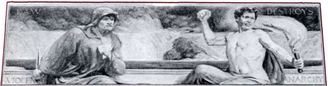
Law Destroys — Violence and Anarchy