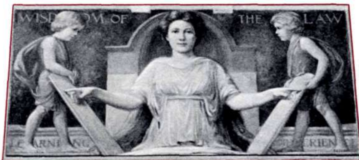
Wisdom of the Law — Learning and Experience

The east wall of the courtroom displays "Attributes of Law," each represented by a seated woman. Other qualities are expressed by the classical figures known as genii.