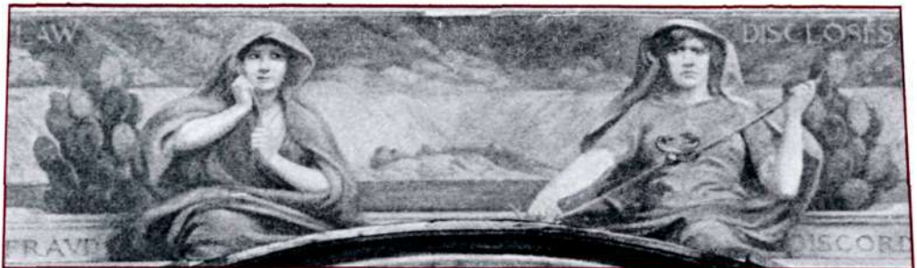
Law Discloses — Fraud and Discord