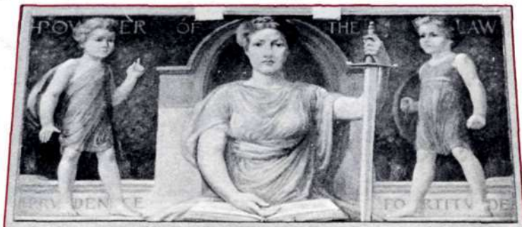
Power of the Law — Prudence and Fortitude